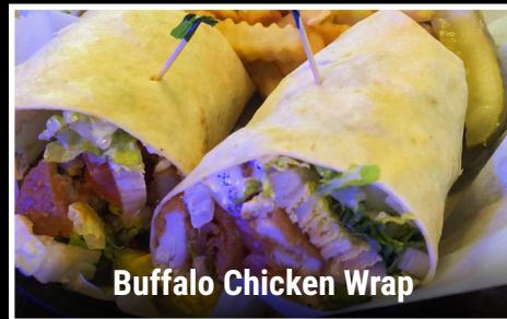
Buffalo Chicken Wrap