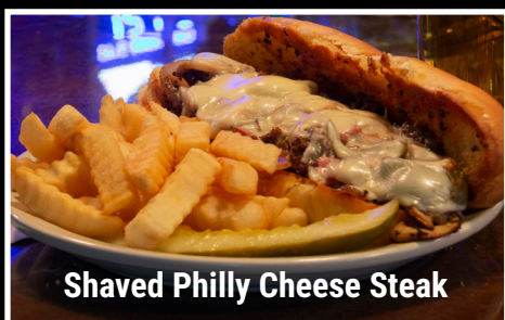
Shaved Philly Cheese Steak