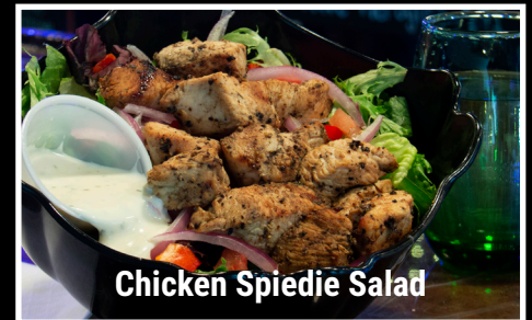
Chicken Spiedie Salad