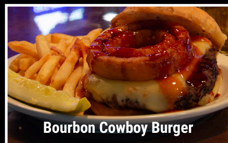
Bourbon Cowboy Burger