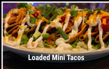
Loaded Mini Tacos