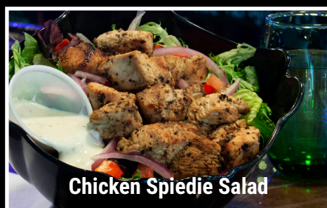
Chicken Spiedie Salad