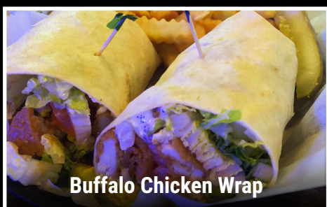
Buffalo Chicken Wrap