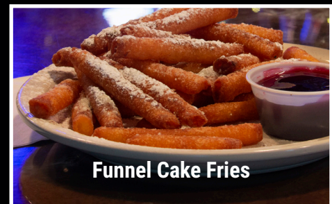
Funnel Cake Fries