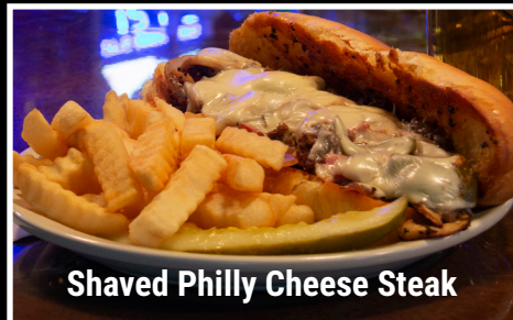
Shaved Philly Cheese Steak