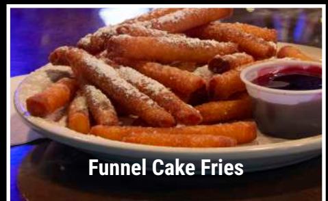
Funnel Cake Fries