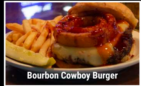
Bourbon Cowboy Burger