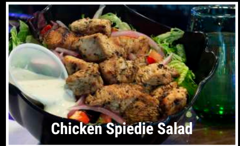
Chicken Spiedie Salad