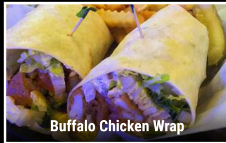
Buffalo Chicken Wrap