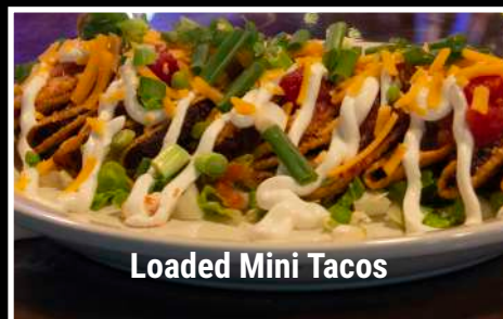
Loaded Mini Tacos