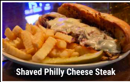
Shaved Philly Cheese Steak