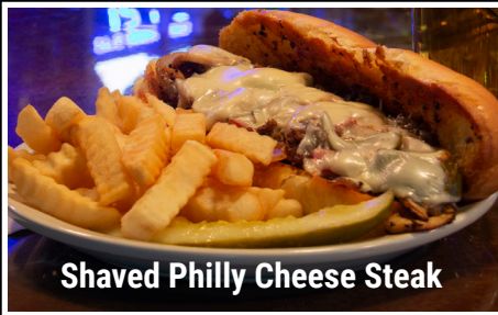
Shaved Philly Cheese Steak