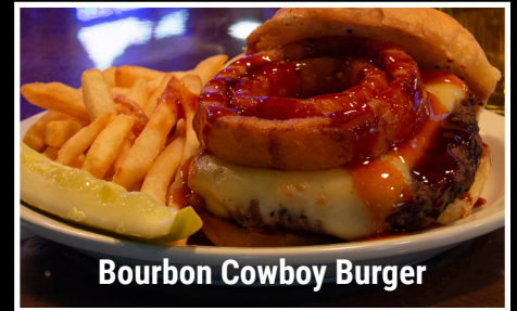
Bourbon Cowboy Burger